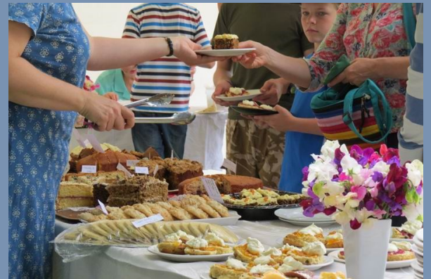
St Mary's, Comberton – Evening to thank everyone who contributes to the life of the church (17 July)